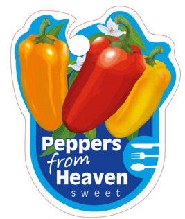
plant tags available