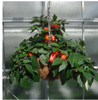
12"pot; 3 plts/container