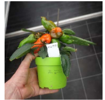
4" PfH Orange cold dip