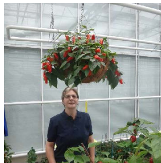
12"PfH Orange 3 plts/container